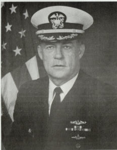
CAPTAIN LEON E. EVERMAN UNITED STATES NAVY